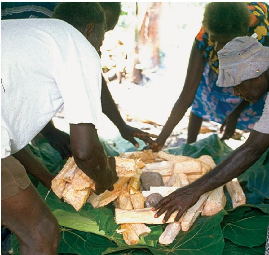
Preparing traditional food, Choiseul Province, Solomon Islands.

...We can learn from these traditions to bring together people from different cultural backgrounds around food.